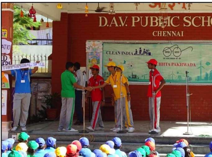
Inter-personal skill – The need of hour