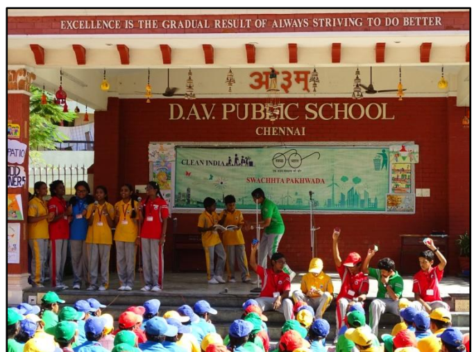
‘Participation’ – Never mind of losing