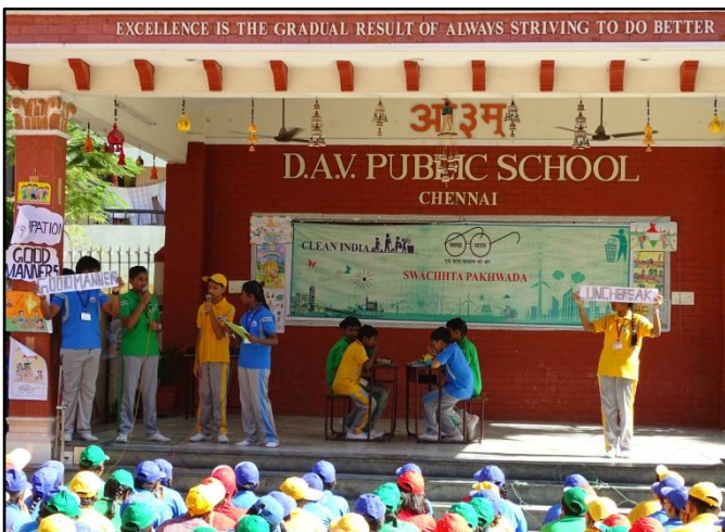
Good Manners – need not be taught but adopted/practised