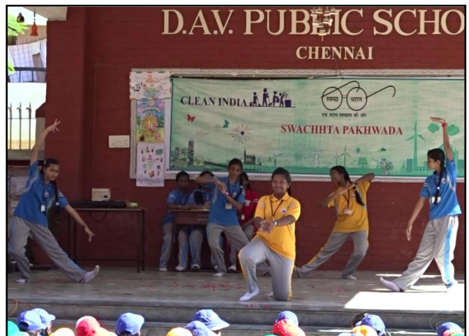
Co-operation & Co-ordination – the 21 st century skills