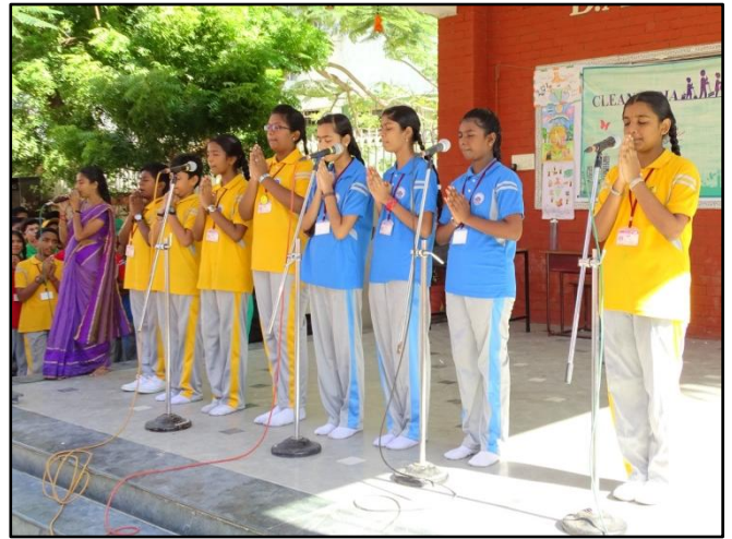
Gayatri Mantra being sung by the Students